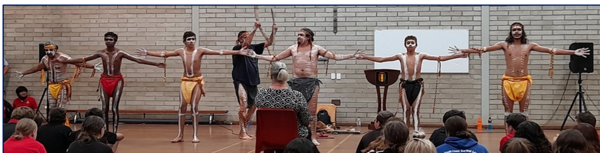
Dancers in the gym

The Wadumbah Traditional Dancers came to the school for a whole school assembly on Wednesday. The Wadumbah Dance Group have been showcasing Bibullmun culture from the South West for many years in the state of Western Australia and all over the world. They are proud to represent Australia overseas in different countries and to entertain and share this ancient culture with Australians on home ground. They do this through music, dance and storytelling. The performance was very well received, and several students and staff joined in the exhilarating dance moves.