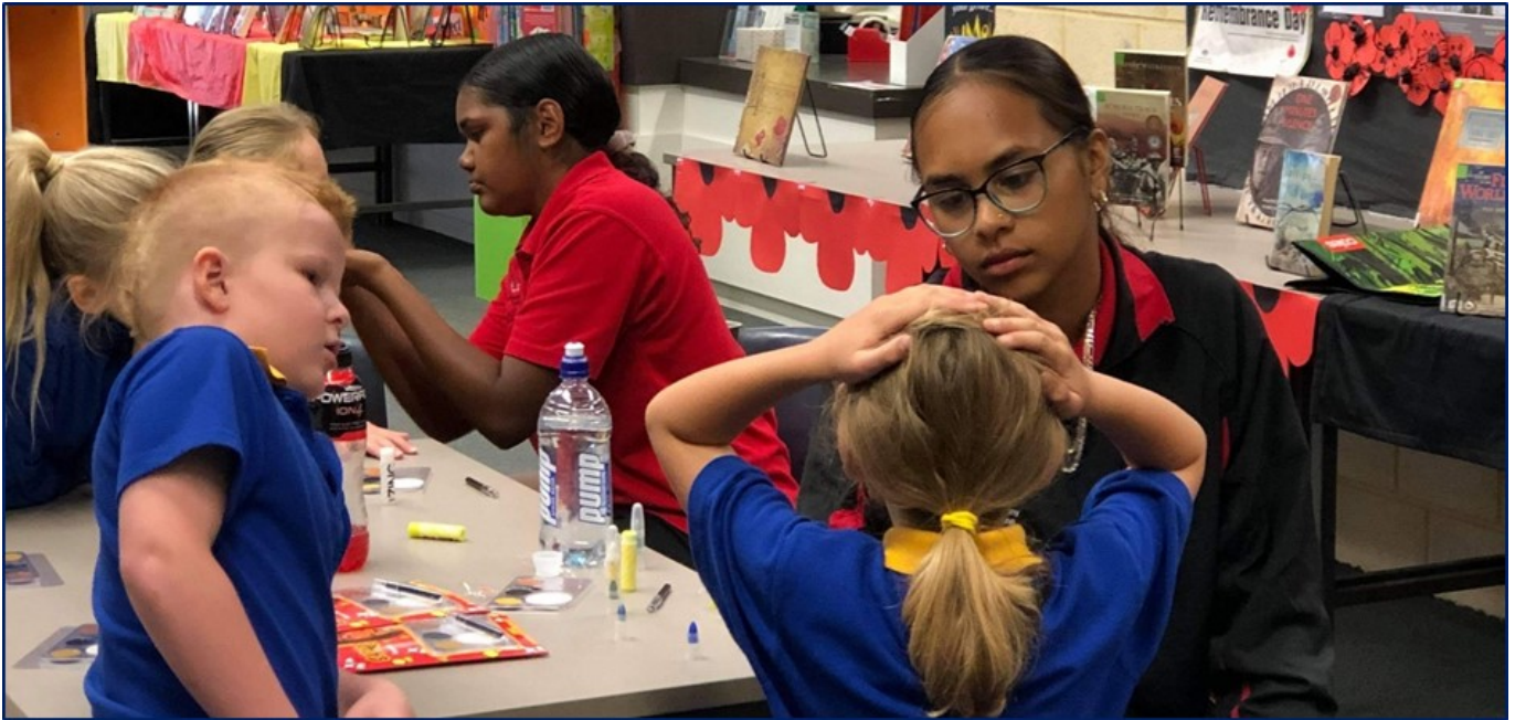
Northam Senior High School student face painting at Northam Primary School

The girls from the Wirrapanda Foundation represented themselves and their school admirably through visits to primary school students to support NAIDOC activities with younger students.