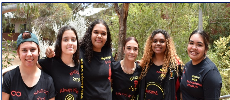
Students from Follow the Dream ready for the bush foods tasting