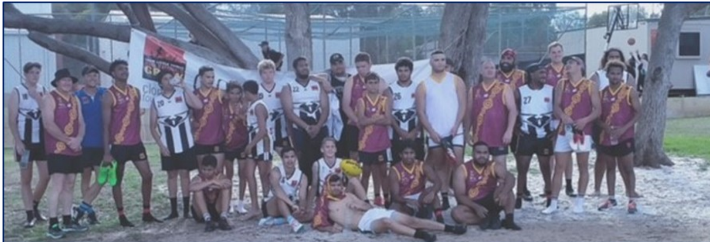
NAIDOC week football games

The activities for NAIDOC week were brought to a conclusion by the traditional footy matches. This year, the Northam Clontarf Year 7/8 team met the boys from the Perth Aboriginal College on the school oval for a friendly contest in a curtain raiser to the main event. Past and present members of Clontarf played the Northam Community team. The team at Clontarf are to be once again commended for their work during NAIDOC week, and with the football games.