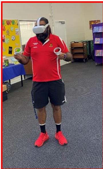
Staff enjoying the virtual reality of underwater diving

On Wednesday November 25 Northam Senior High School hosted the Virtual Reality Wheatbelt Roadshow Western Australia provided by EducateIT . EducateIT assist schools in their organic growth of an ICT environment. At the library many students and staff were given an opportunity to use the Oculus Quest 2. The technology has many benefits to education and Northam SHS will pursue the implementation of such technology before the end of 2020.