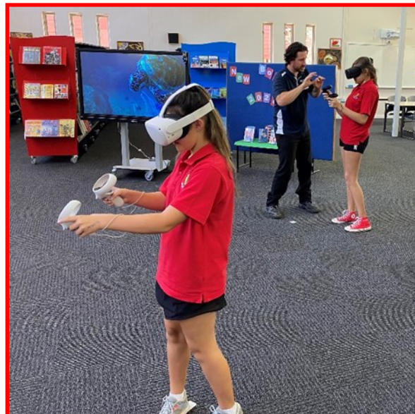
Students enjoying the virtual reality of underwater diving