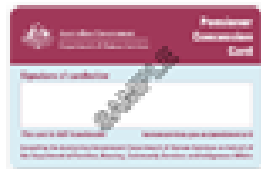
Pensioner Concession Card